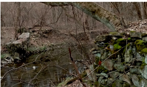
Remnants of the Mill Dam

Most of the Miller Preserve consists of grassy floodplain woods under an open canopy of black walnut. This area was the site of a project to grade the stream back and connect the creek with the floodplain. Native grasses, herbs, scrubs and trees were planted in 2008 and some of these persist. River-rye, showy tick-trefoil, ox-eye, and golden alexanders were noted along the inner edge of the floodplain. The most notable area of the Miller Preserve is the narrow steep ridge in the extreme south, jutting almost into Valley Creek. Here, along the east slope and at the base of the tip, is a small sampling of the original woodland flora of the area, including miterwort, basswood, wild gooseberry, a fallen but still living hop-hornbeam, the fern blunt-lobed woodsia and several clumps of wild columbine.