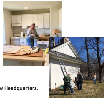
Board Members helping to spruce up the new Headquarters.